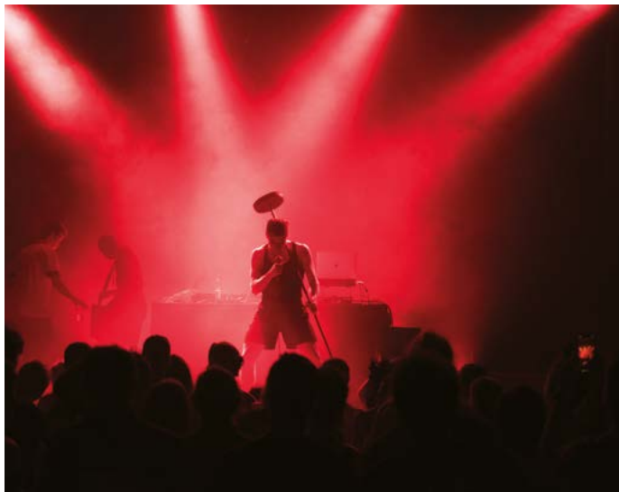
Nelson Beer at the Rockstore on June 29th 2019 ← © Marc Domage