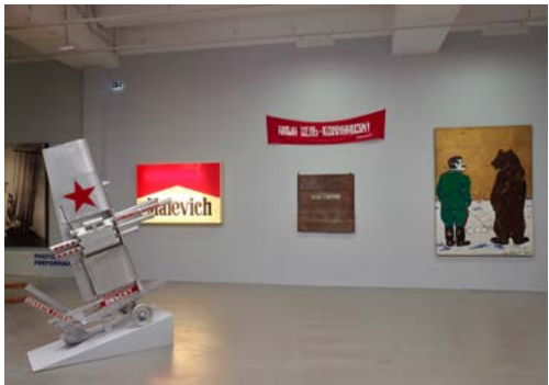
MO.CO. Hôtel des collections The non-conformists. The Story of a Russian Collection Exhibition from 13 November 2019 to 2 February 2020 In partnership with the Tretyakov Gallery, Moscow. Guest curator: Andrei Erofeev Overview