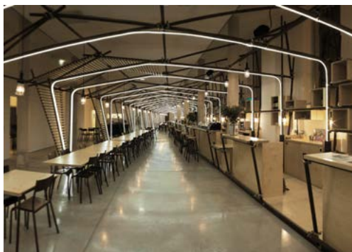
MO.CO. Hôtel des collections → Café/restaurant Le Café de La Panacée

24 lignes , 2013 MO.CO. Panacée Sculpture and lighting installation. 24 light strips fixed to an oxidised scaffolding structure and programmed to reflect different breathing patterns, created by 1024 architecture.