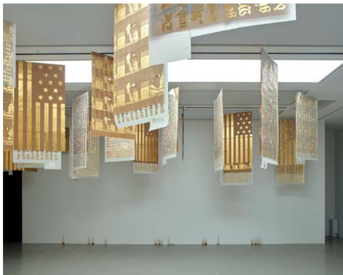
MO.CO. Hôtel des collections ← Danh Vo Exhibition Intimate Distance. Masterpieces from the Ishikawa Collection Inaugural exhibition from 29 June to 29 September 2019 © Marc Damage