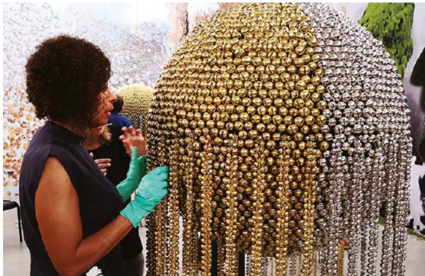
MO.CO. Panacée Chronotopic Traverse, 2019 Sonic Half Moon Type III - Medium Light #18 Haegue Yang, 2014

In order to reach the widest possible audience, cultural mediators develop targeted initiatives focusing on non-profit associations and people who do not usually engage with culture. These include tours and workshops in sign language, tours combined with workshops for people with learning difficulties or mental health issues, and sensory and descriptive tours for blind and visually-impaired people.