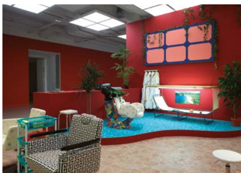
MO.CO. Hôtel des collections → Sol Calero, Bienvenidos a Nuevo Estilo , 2014 Exhibition Mecarõ. Amazonia in the Pettigas collection Exhibition from 6 March to 20 September 2020 © Marc Damage