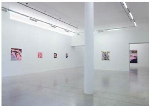
MO.CO. Panacée → Exhibition Ambera Wellmann. Unturning Monographic exhibition from 5 October 2019 to 5 January 2020 Overview