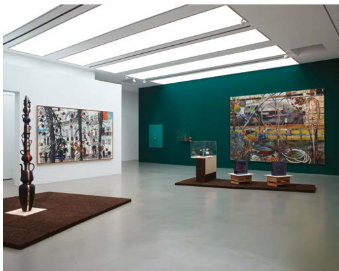
MO.CO. Hôtel des collections ← Exhibition Amazonia in the Pettigas Collection Exhibition from 6 March to 20 September 2020 Overview