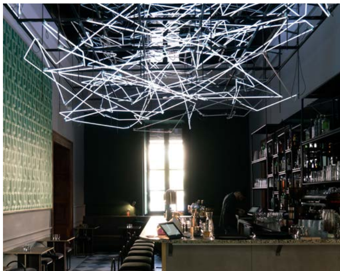
MO.CO. Hôtel des collections ← Café/restaurant Le Faune

Loris Gréaud, Idle Mode , 2019 MO.CO. Hôtel des collections Neon light fitting and soundbites from the book Electronic Revolution by William S. Burroughs, read by Abel Ferrara.