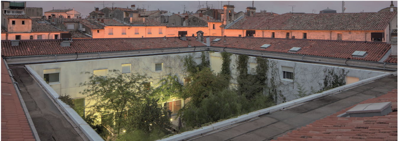
MO.CO. Panacée