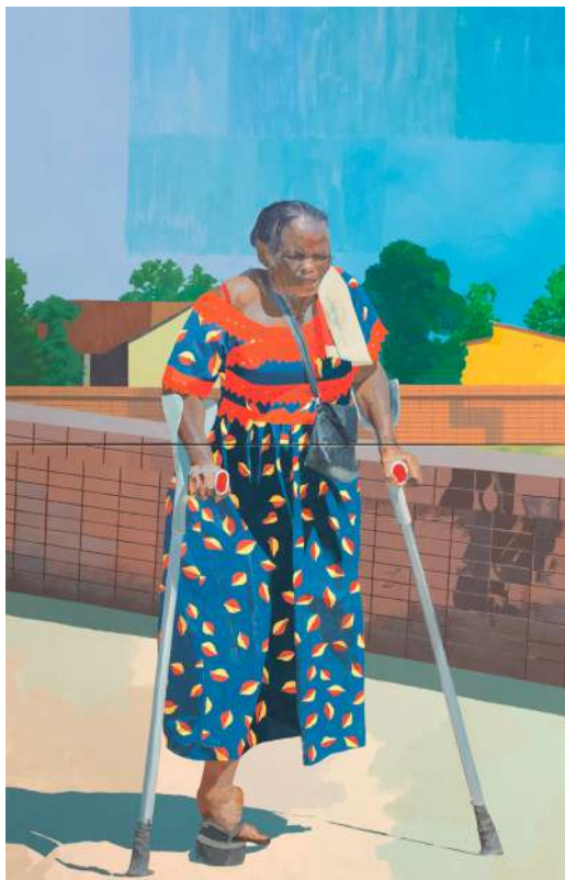
David MBUYI Miroir , 2023 Oil on canvas, 228 x 146 cm