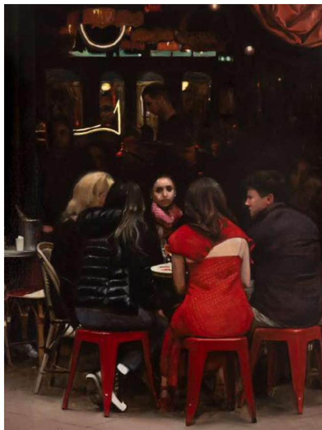
Bilal HAMDAD Vermillon , 2024 Oil on canvas, 162 x 130 cm Courtesy Templon gallery © Adagp, Paris, 2026