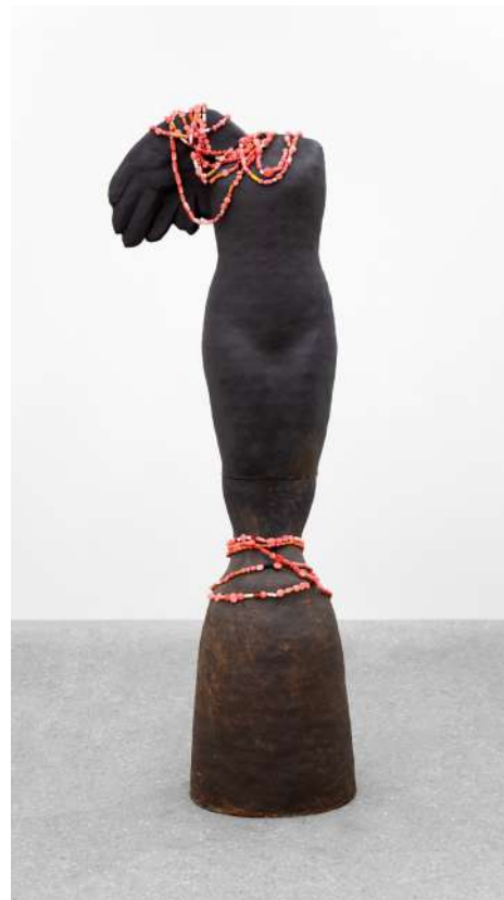
Nina JAYASURIYA Ange Mercure, 2025 Stoneware, medicines, mercurochrome 160 x 70 x 45 cm