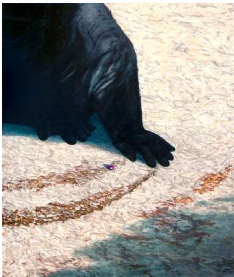
Blaise SCHWARTZ Mouvement au sol , 2023 Oil on canvas, 100 x 80 cm Courtesy of the artist © Blaise Schwartz