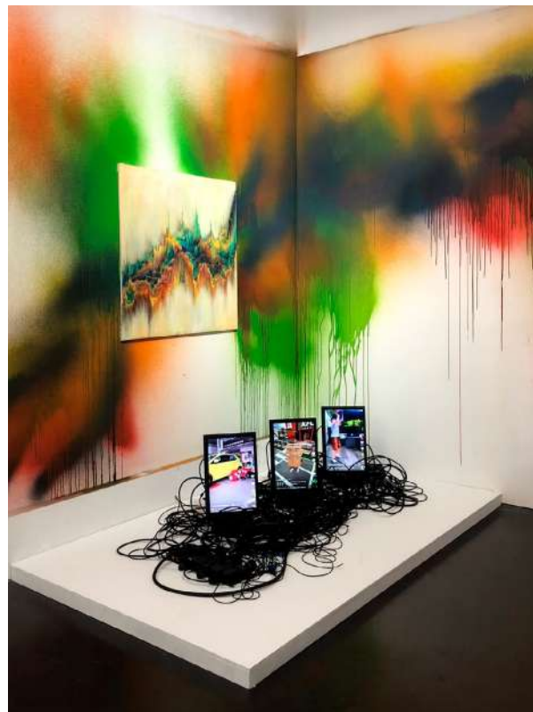
Pierre PAUZE Draw me a bull , 2025 Oil on canvas, 150 x 150 cm Wall painting, 3 screens, cables, variable dimensions © Adagp, Paris, 2026