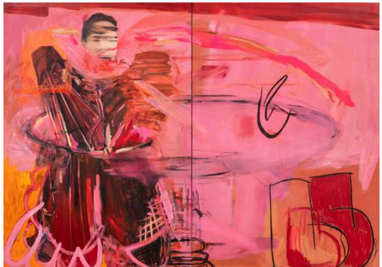
Dora JERIDI Where to go? How to go? , 2023 Oil, oil stick, and charcoal on canvas, 195 x 260 cm Société Générale Collection.