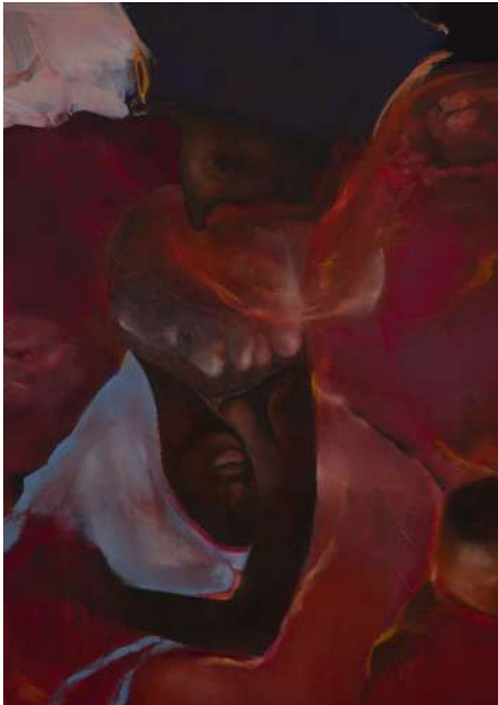
Clémence GBONON Secret Gardens , 2024 Oil on canvas, 116 x 89 cm Private collection

artists are not bound by a common aesthetic but rather by their shared experience of being mentored into becoming artists. More than an expression of a formal heritage, the exhibition celebrates transmission understood as a passage, a momentum, an invitation to pave one's own way.