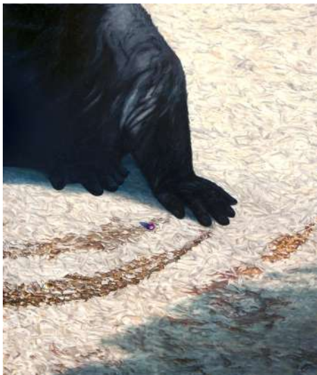
Blaise SCHWARTZ Mouvement au sol , 2023 Oil on canvas, 100 x 80 cm Courtesy of the artist © Blaise Schwartz