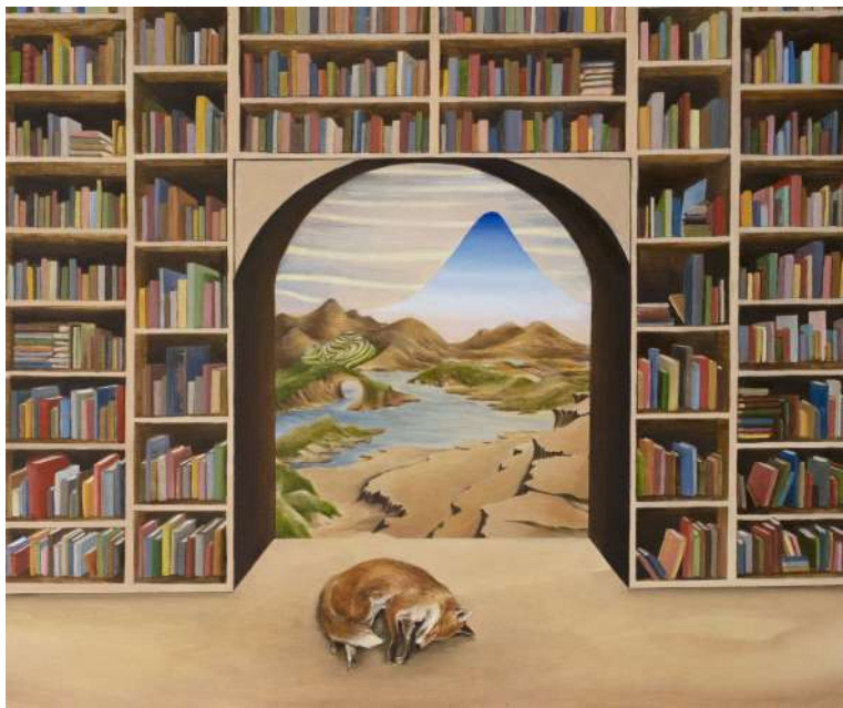
Zélie NGUYEN La bibliothèque de babel, 2023 Oil on wood, 46 x 38 cm Private collection. Courtesy By Lara Sedbon © Zélie Nguyen