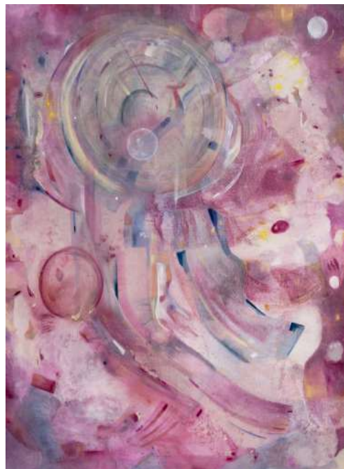
Mathilde DENIZE Sound of Figures , 2025 Acrylic and watercolor on canvas, glitter 200 x 180 cm Courtesy of the artist and Perrotin. Produced by Frac Île-de-France. Photo: Tanguy Beurdeley © Adagp, Paris, 2026