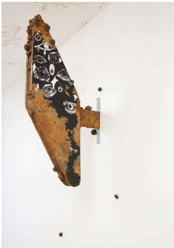
Tristan CHEVILLARD La gorge du dragon (Post-industrial effigy) a tribute to Gyaos , 2025 Mixed media, variable dimensions