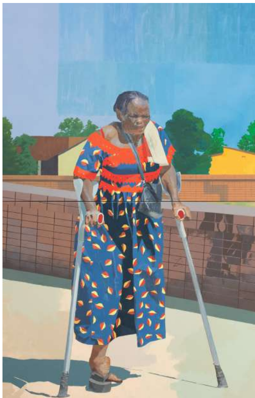
David MBUYI Miroir , 2023 Oil on canvas, 228 x 146 cm