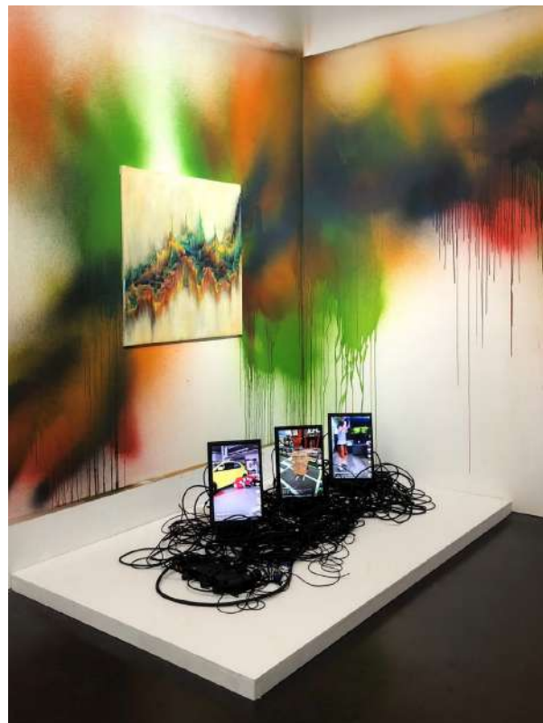
Pierre PAUZE Draw me a bull , 2025 Oil on canvas, 150 x 150 cm Wall painting, 3 screens, cables, variable dimensions © Adagp, Paris, 2026