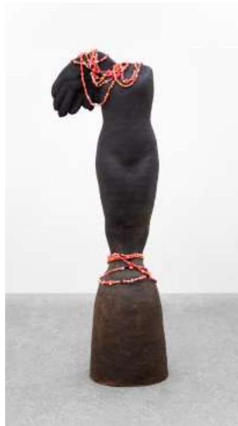
Nina JAYASURIYA Ange Mercure, 2025 Stoneware, medicines, mercurochrome 160 x 70 x 45 cm