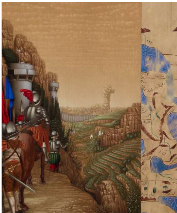
Rayan YASMINEH Le siège , 2025 Oil on canvas, 46 x 38 cm Courtesy of the artist and mor charpentier