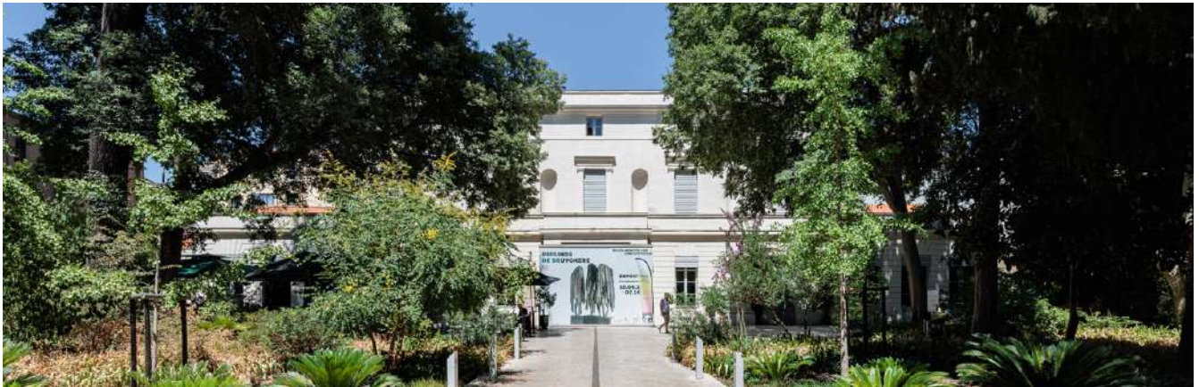
MO.CO. Montpellier contemporain, 2022