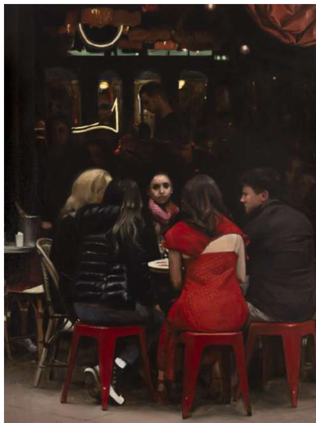
Bilal HAMDAD Vermillon , 2024 Oil on canvas, 162 x 130 cm Courtesy Templon gallery © Adagp, Paris, 2026