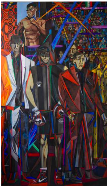
Raphaëlle BENZIMRA Portrait de Dmitry Bivol, 2024 Oil on canvas, 195 x 114 cm