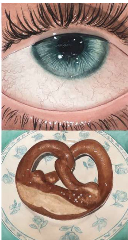
Léo DORFNER Controlling my feelings for too long, 2025 Watercolour on papier, 70 x 50 cm Courtesy of Claire Gastaud gallery © Adagp, Paris, 2026